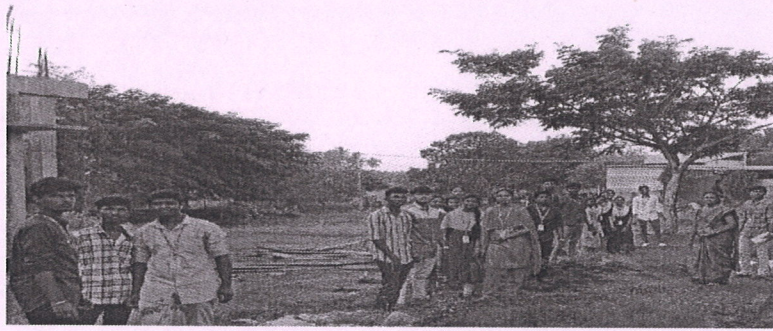
Sri Lakshmi Vidyalaya Matric Hr. Sec. School students, Thadicombu.